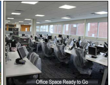
Office Space Ready to Go