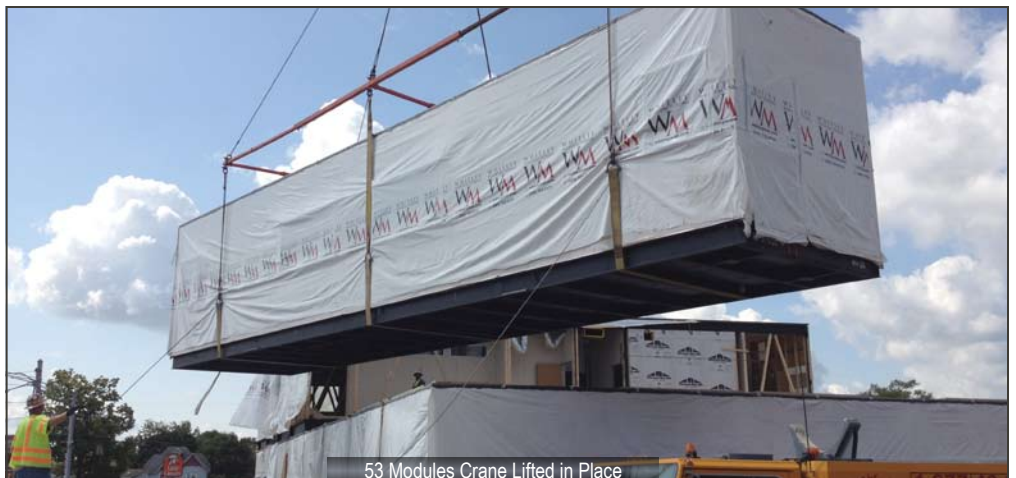
53 Modules Crane Lifted in Place

Serving you nationwide from South Whitley, IN (260) 723-5131 • Rochester, IN (574) 223-4934 • Marysville, WA (360) 653-5790 & Leola, PA (717) 656-2081 • Visit us online at www.whitleyman.com