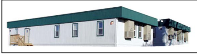
Sample Exterior. Refer to Plan for Building Size & Layout.

Our Clearspan Two design offers the flexibility of open space and the opportunity for a custom building layout. Our Clearspan buildings are available for rapid delivery, helping you adapt to changing markets and controlling construction costs with our economical modular construction system.