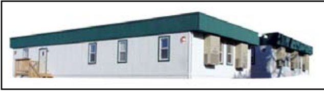
Sample Exterior. Refer to Plan for Building Size & Layout.