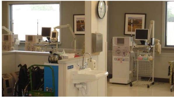
INTERIOR VIEW OF DIALYSIS TREATMENT AREA (HEARNE, TX)