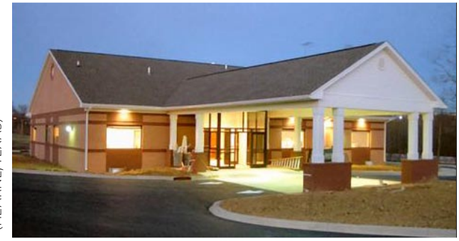
EXTERIOR OF FREESTANDING DIALYSIS CLINIC (LAGRANGE, KY)