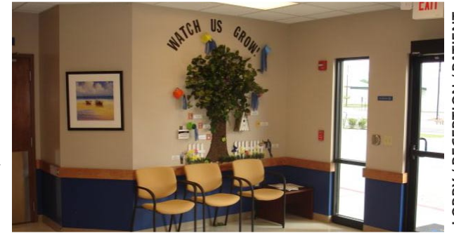
LOBBY / RECEPTION / PATIENT WAITING AREA (HEARNE, TX)