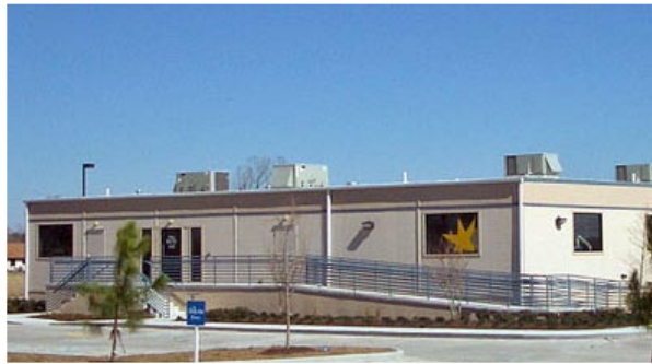
EXTERIOR OF FREESTANDING DIALYSIS CLINIC (LA PLACE, LA)

Our previous dialysis projects have received recognition with Awards of Distinction from the Modular Building Institute and our clientele includes numerous repeat customers.