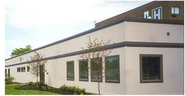
EXTERIOR VIEW OF A DIALYSIS EXPANSION TO A HOSPITAL (NORTH PENN HOSPITAL)