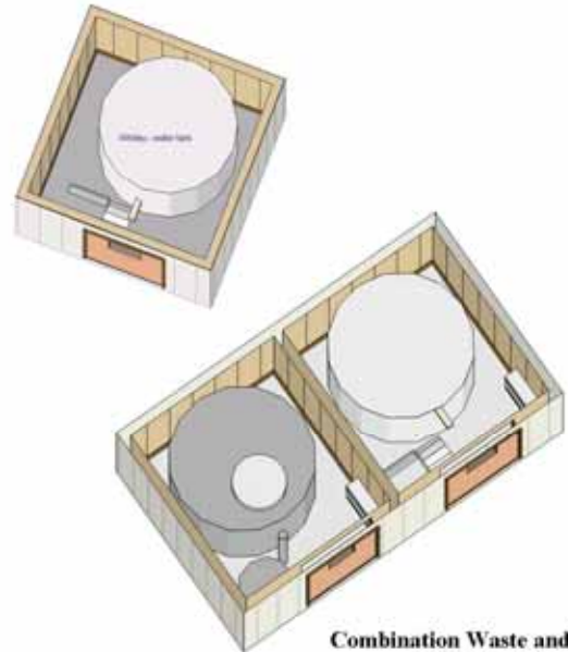
Combination Waste and Water holding tank