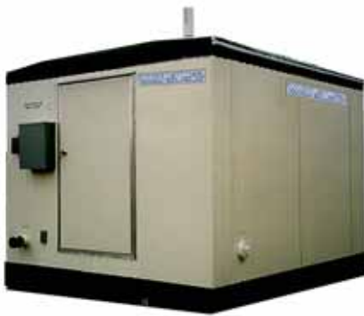
Waste holding tank