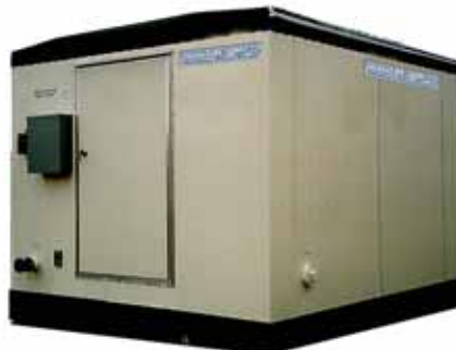
Water holding tank