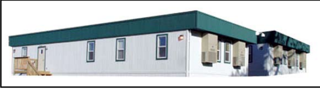
Sample Exterior. Refer to Plan for Building Size & Layout.