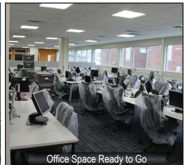
Office Space Ready to Go