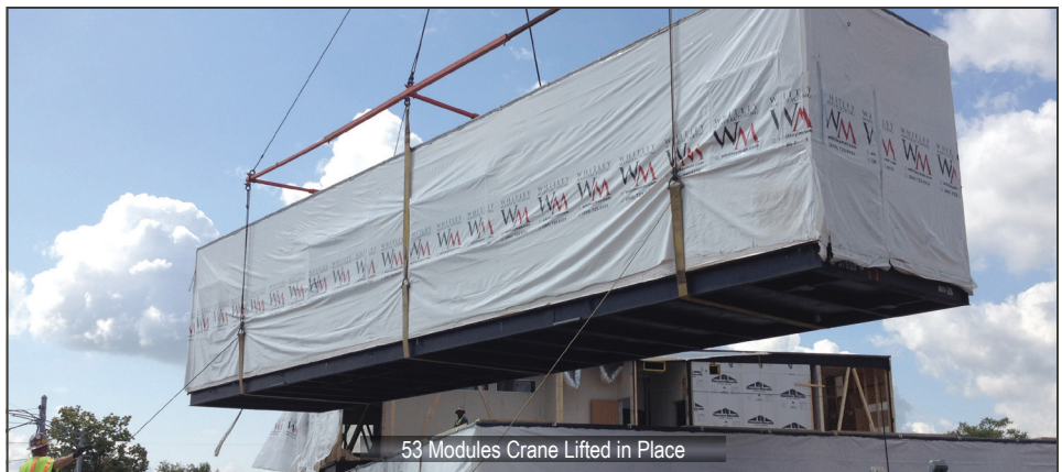
53 Modules Crane Lifted in Place

Serving you nationwide from South Whitley, IN (260) 723-5131 • Rochester, IN (574) 223-4934 • Marysville, WA (360) 653-5790 & Leola, PA (717) 656-2081 • Visit us online at www.whitleyman.com